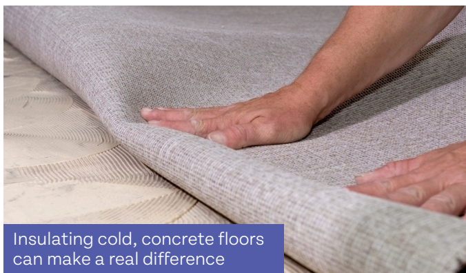
Insulating cold, concrete floors can make a real difference

materials such as sheep's wool and wood fibre boards are recommended.