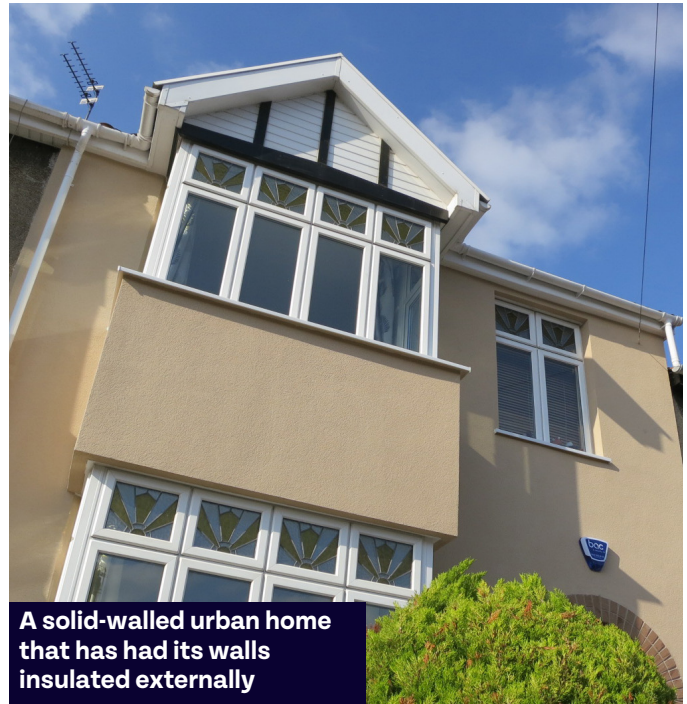
A solid-walled urban home that has had its walls insulated externally

External solid wall insulation involves adding a layer of insulating material to the outside walls of a building and coating this with a protective render or cladding.