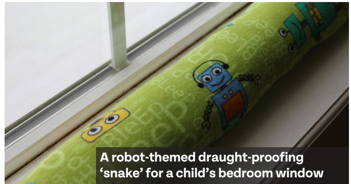
A robot-themed draught-proofing 'snake' for a child's bedroom window

Most houses, particularly old ones, have cracks and gaps through which warm air goes out and cold air blows in. Not all can be dealt with by a DIY-er, but many can. These include the gaps between or around floorboards; gaps around windows and doors; the letterbox; holes where pipework comes through floors and external walls; around the loft hatch; and around electrical fittings.