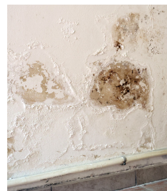
Left: Penetrating damp can cause paint to flake. Right: Rising damp in wall can look like this, but can be difficult to diagnose.