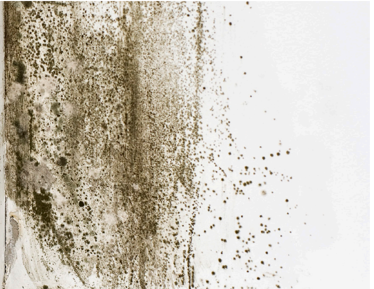
Mould caused by condensation damp is characterised by black dots, like on this window recess.

There are three ways that your home can become damp: