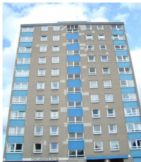
Figure 1: Typical apartment block in Edinburgh, Scotland

The project worked with 24 case study buildings across six European countries. The LEAF partners