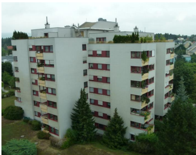
Figure 6: Endemanngasse case study, Austria

One issue encountered during the project was the inaccuracy of EPC calculations. For the properties in Endemanngasse, three different EPC calculations were carried out and each showed a different heat energy demand (57.65 kWh/m 2 a, 71.96 kWh/m 2 a and 95.63 kWh/m 2 a). This difference was because of different assumptions of the building construction. However it lowered residents' trust in the EPC as a whole and the calculations of the prospected energy savings.