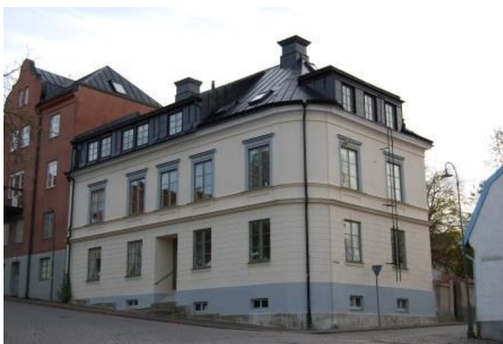
Figure 10: Kommendantsbacken case study, Sweden

Communication with the Swedish case studies was reasonably straightforward because the majority of boards have monthly meetings where decisions are made. Naturally where the investment costs are higher the decision-making process is more complicated and takes a longer time. Communication with one of the case study buildings was difficult and contact was eventually lost.