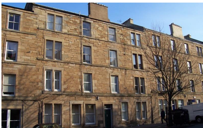
Figure 15: Typical apartment block in Edinburgh

Interest in the LEAF project has been very high, which shows both the importance of this issue and the multitude of stakeholders involved in multi-occupancy apartment blocks. Retrofitting apartment blocks will continue to be challenging since by their nature these properties will always have more challenges and barriers than single dwellings. However, by sharing lessons across partner countries, the LEAF project has shown that significant savings can be achieved from retrofitting these buildings. It has also highlighted how practice and policy must develop to ensure that retrofit of these buildings can occur on a larger scale, and that carbon, energy and fuel poverty goals are achieved.