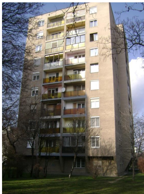
Figure 9: Dolgozó case study, Budapest

The main goal of the technical documents and information materials was to ensure the communities could make informed and responsible decisions. The LEAF project helped them to become aware of their opportunities and this in itself is a success that may lead to installations in the future.