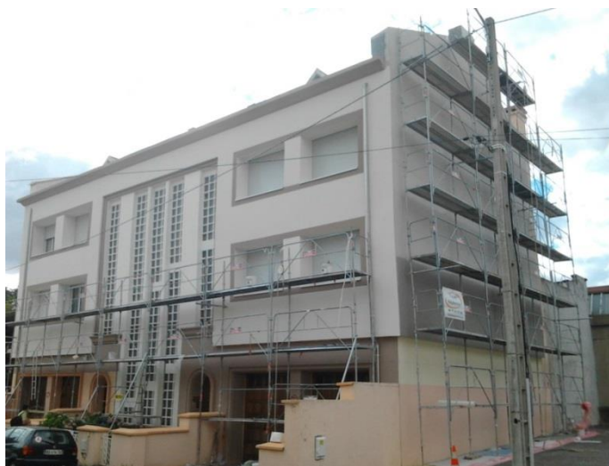
Figure 7: Moulinier case study, France

The French case studies highlighted that engaging and convincing residents needs time and resources. It was found that owners need different types of support: technical, communication and financial. The local energy agencies helped them with those different aspects by carrying out the EPC, helping them find installers or engineer for the works, liaison with professionals, offering advice and support at the owners meeting, assisting in the creation of communication documents, informing local energy agencies and helping the owners with subsidies and zero interest loans. However to help other buildings do the same, the French partners looked to maximise the resources provided through the engagement toolkit.