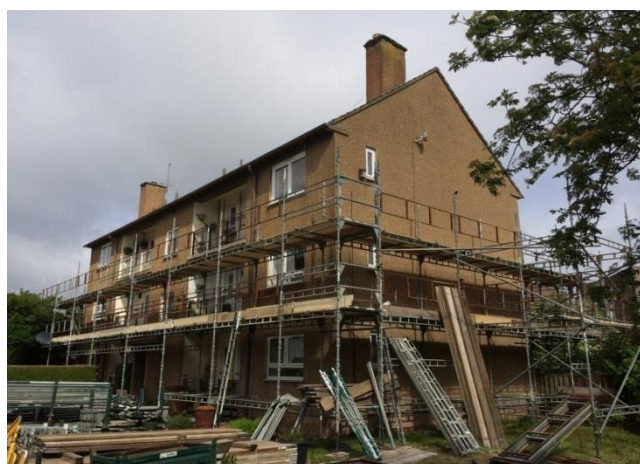
Figure 13: Telford Road case study, Edinburgh

In Telford Road engagement was carried out by Home Energy Scotland – a free, impartial energy advice service which is delivered by Changeworks in South East Scotland. They used a multi-pronged approach to engage residents (letters, door-knocking and events), which was successful in reaching all residents.