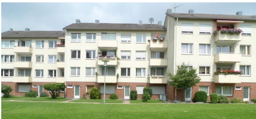
Figure 8: Klosterweiher case study, Germany

The situation is different for "single owners" who only own one flat that they live in. Often these owners are of pensioner age or lower-income families and their motivation towards energy retrofit comes up against serious barriers; for example, the difficulty to pay for measures with long payback times. Long