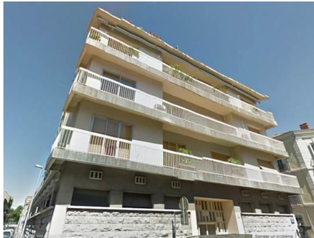
Figure 2: Previous case study building in France

For retrofit to happen on a large scale, the barriers identified here must be removed or reduced. The project has demonstrated practical ways in which some barriers can be minimised, for example through impartial support and advice. It has created toolkits to help stakeholders further this process and shared lessons with stakeholders across Europe. However, it also shows that improvements to EPCs are needed to fully realise their potential to drive retrofit, and that policies at the EU and national level must provide a supportive framework that incentivises and actively pushes for retrofit. Without these changes, retrofit of apartment blocks, which can result in significant energy consumption and CO 2 emission reductions, is unlikely to happen on a greater scale.