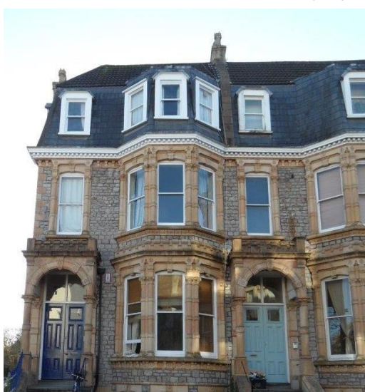
Figure 11: Manilla Road, Bristol

In Manilla Road, the focus of the project was on installing solid wall insulation but it did not manifest because of restricted funding options (and funding rapidly reduced through the project term). Draught-proofing was installed in one apartment and home visits were undertaken with each apartment, meaning there are likely to be behaviour changes. Predicted savings on energy demand, CO 2 emissions and fuel bills of the installed measures are all beneath 1%. Low energy lighting, heating controls and a boiler replacement are all measures that the management company intends to install at a later date (hopefully in the next three years). This would result in greater savings: 4,096 kWh, 2.13 tonnes of CO 2 savings, and £507 in annual fuel bill savings for the whole block.