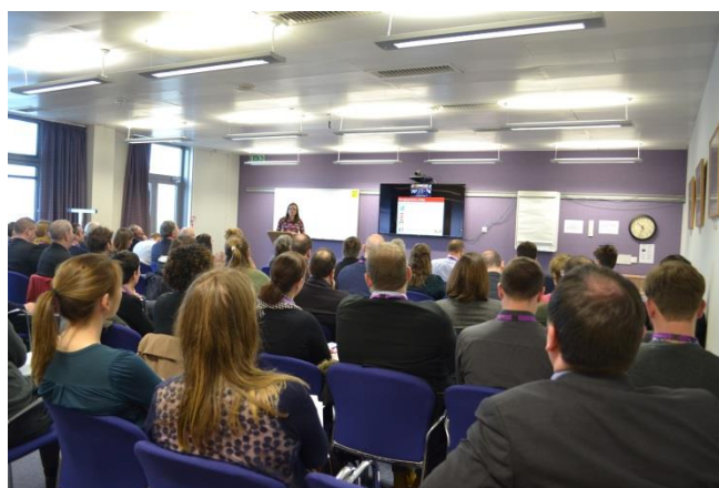
Figure 3: Stakeholder workshop in Edinburgh, UK

Key to the success of the project was engaging with key stakeholders in each country and sharing details of the project, results and lessons. Stakeholders were identified in each country and partners undertook a range of communication activities including presenting at events and conferences, online promotion and newsletters.