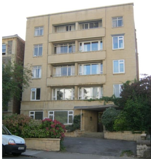
Figure 12: College Court, Bristol

In both cases, EPCs were used as a starting point to understand what measures could be installed. However, not all measures identified within the EPCs were actually viable options (e.g. gas condensing boiler suggested in College Court where there is no gas), and whilst used as a starting point, the EPCs were not referred to other than at this early stage.