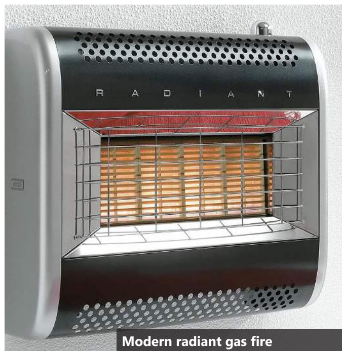
Modern radiant gas fire

Portable gas heaters don't need flues, however you still need to make sure the room is well ventilated. Otherwise, there is a risk from carbon monoxide and the water vapour