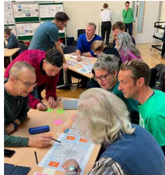
We work with community organisations and parish councils to help them use the planning system to boost renewable energy.

Our workshops with Climate Outreach and mapping of their Britain Talks Climate segments, helped communities to frame messages on positive climate actions.