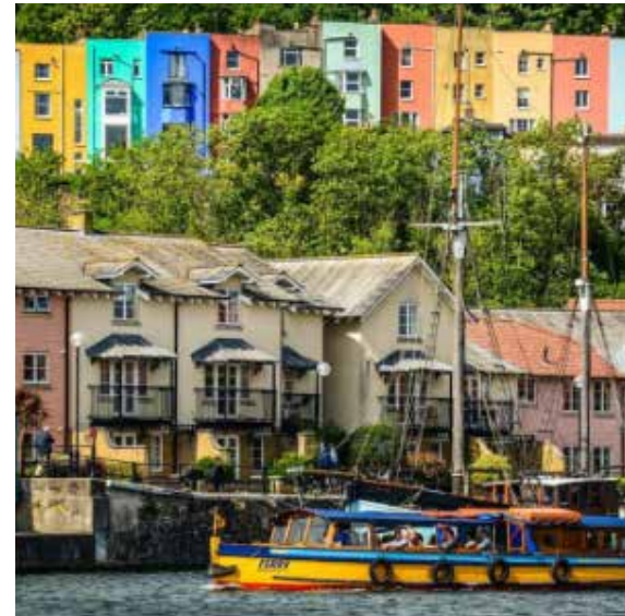
We're a key partner in Mission Net Zero, a £5m initiative to accelerate Bristol and the West of England's transition to net zero.

We completed research for the Committee on Climate Change into barriers and opportunities for delivering net zero and climate resilience through the local planning system. Stakeholder engagement with over 100 different individuals and organisations showed that planning needs to do more in defining and delivering strategic pathways to net zero.