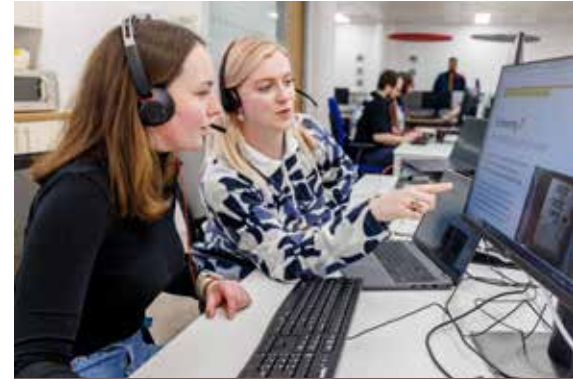
Our free telephone services gave advice to over 33,000 people in 2024.

We were delighted to win the Vulnerable Customer Support award at the 2023 National Energy Efficiency Awards in recognition of our support for people in fuel poverty. (We won the regional award in the previous financial year.)